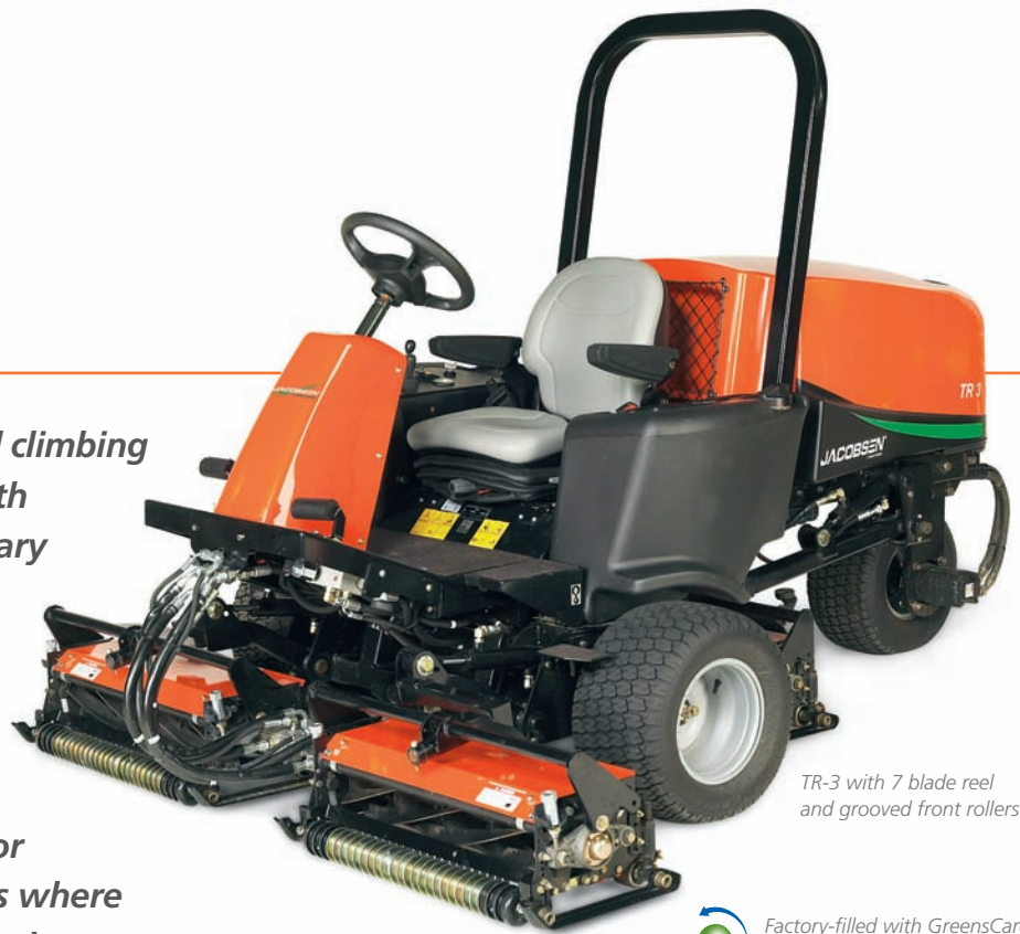
TR-3 with 7 blade reel and grooved front rollers